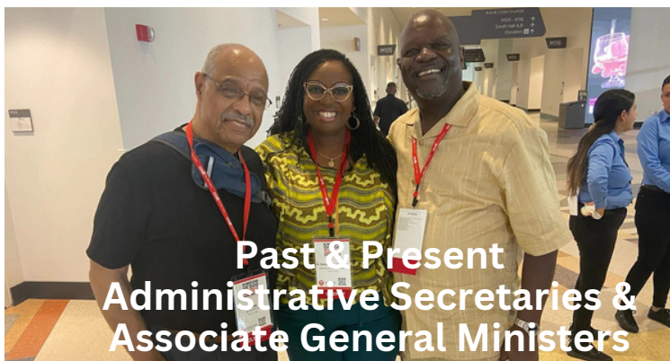
Past & Present Administrative Secretaries & Associate General Ministers

It is with immense joy that I submit this report on the week that I celebrate one year of the announcement that I was being called as the new Administrative Secretary of the National Convocation and Associate General Minister of the Christian Church (Disciples of Christ). Even though I am 77 days from celebrating one full year in this position, I am proud to report that 2023 has been an energizing year for us.