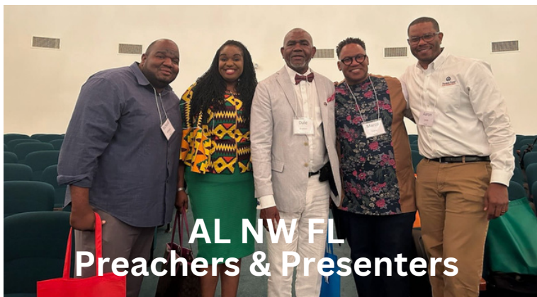
AL NW FL Preachers & Presenters

It is with immense joy that I submit this report on the week that I celebrate one year of the announcement that I was being called as the new Administrative Secretary of the National Convocation and Associate General Minister of the Christian Church (Disciples of Christ). Even though I am 77 days from celebrating one full year in this position, I am proud to report that 2023 has been an energizing year for us.