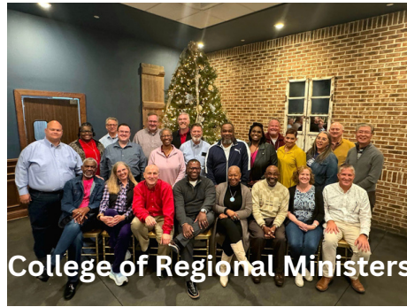
College of Regional Ministers