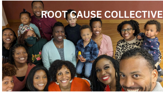
ROOT CAUSE COLLECTIVE