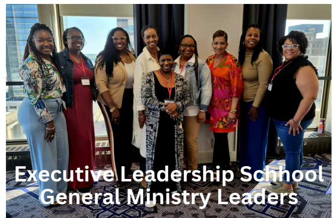
Executive Leadership School General Ministry Leaders